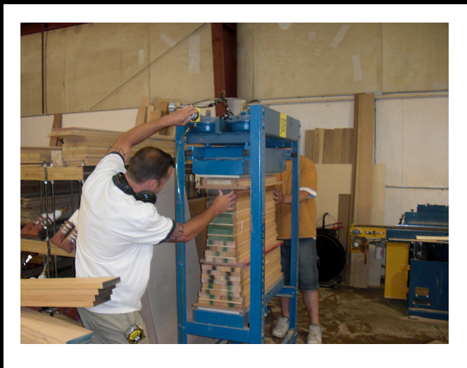
Dial Regulator Allows operator to carefully engage material for perfect alignment